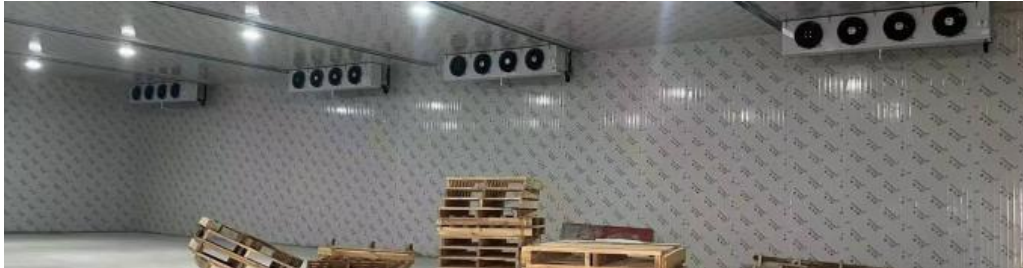
Plate effect: flat, embossed, small ripples, pressure ribs

Regular colors: White gray, large wall gray, dark blue