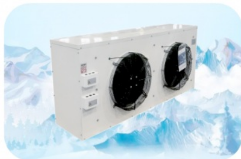
Experience the Power of Pure Refreshing Air with DaMai Air-Cooled Air Cooler