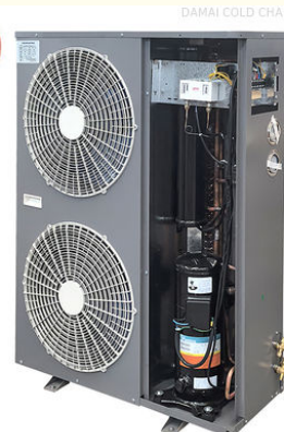
DAMAI COLD CHAIN EQUIPMENT