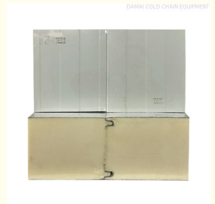
DAMAI COLD CHAIN EQUIPMENT