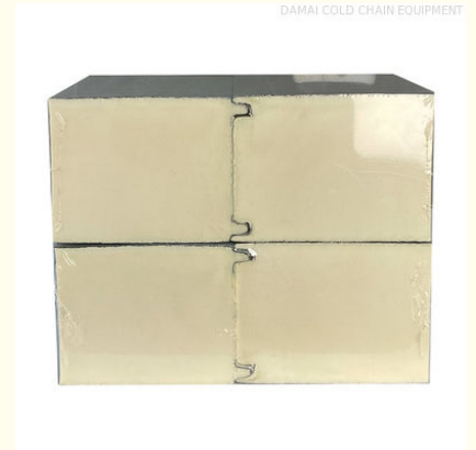
DAMAI COLD CHAIN EQUIPMENT