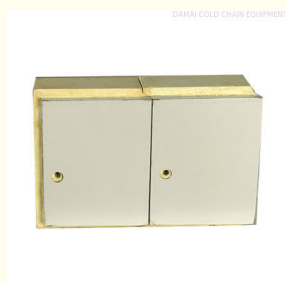
DAMAI COLD CHAIN EQUIPMENT