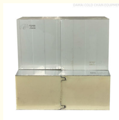
DAMAI COLD CHAIN EQUIPMENT