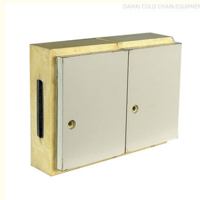
DAMAI COLD CHAIN EQUIPMENT